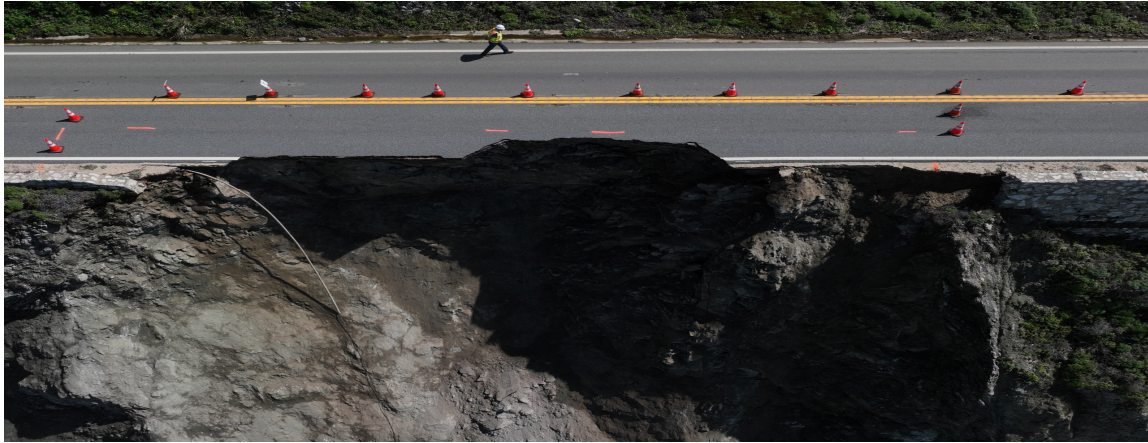
CA Rte. 1. The Big Sur Coast Highway, was completed in 1937

With sea level rise and climate change intensifying winter storms, officials are bracing for more severe erosion along the cliffs and rocky escarpments that undergird Highway 1. The road's geography has always been tough. San Francisco Chronicle 4/3/24